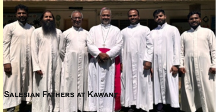
SALESIAN FATHERS AT KAWANT