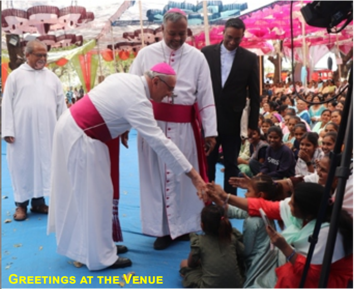
GREETINGS AT THE VENUE