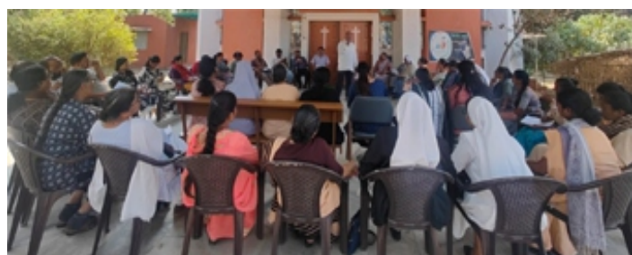
Feb 6: 45 Priests and Religious Meet at Jhagadia to Plan for the Women Sammelan