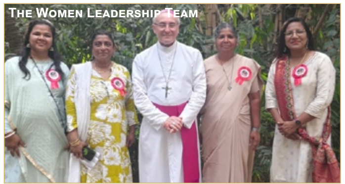
THE WOMEN LEADERSHIP TEAM