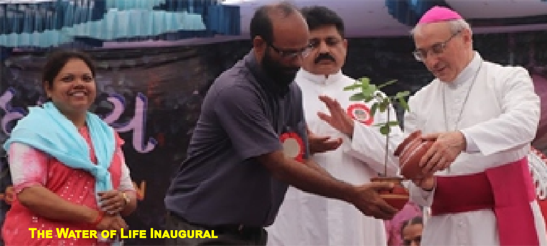
THE WATER OF LIFE INAUGURAL

The Sammelan opens with the watering of a plant, symbolic of the water of life, the theme of the day. The Nuncio then released a dove (front page) to symbolise the mission that the water of life enables us to undertake. It set the tone for the dancing crowd of over 3400, women, around 200 odd priests and religious, around 100 PPC members not counting the children who accompanied them.