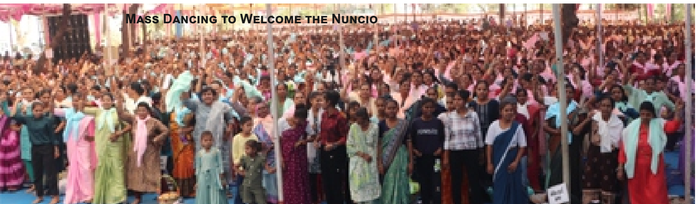
MASS DANCING TO WELCOME THE NUNCIO