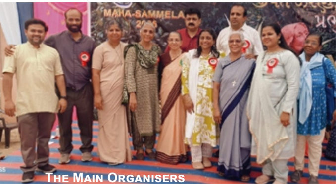
THE MAIN ORGANISERS

The Sammelan opens with the watering of a plant, symbolic of the water of life, the theme of the day. The Nuncio then released a dove (front page) to symbolise the mission that the water of life enables us to undertake. It set the tone for the dancing crowd of over 3400, women, around 200 odd priests and religious, around 100 PPC members not counting the children who accompanied them.