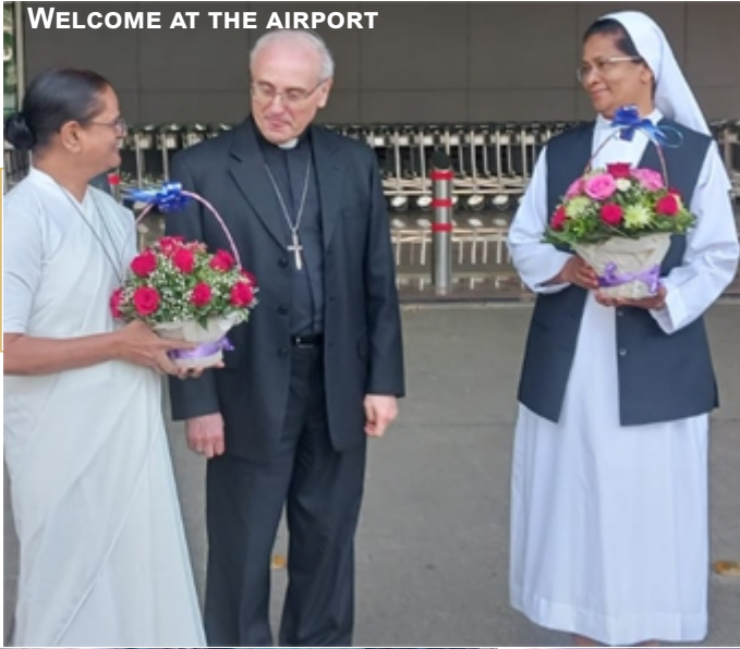
WELCOME AT THE AIRPORT