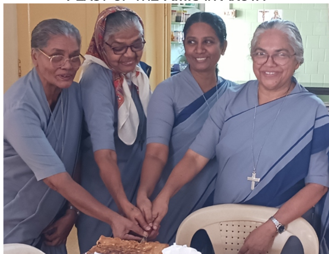
VISIT OF THE SVD GENERAL COUNCILLOR FEAST OF THE RMIS IN AKOTA