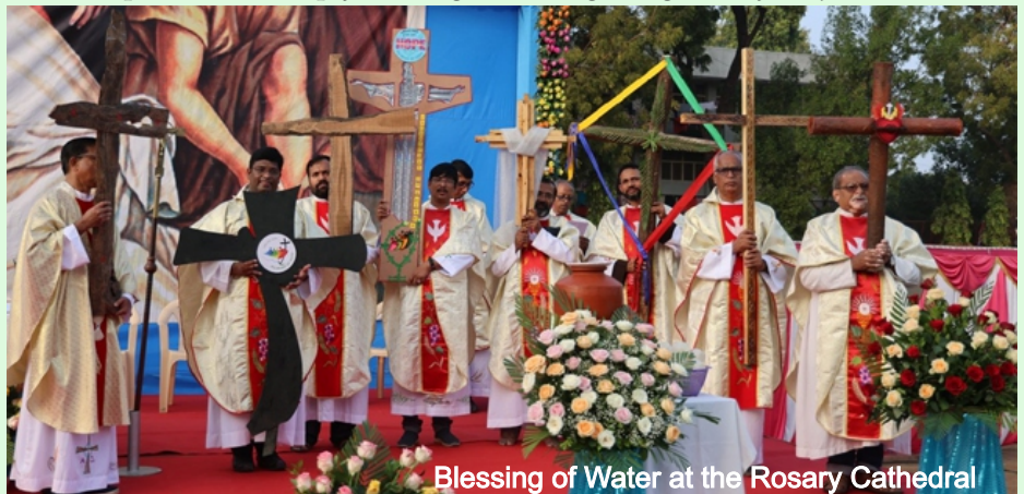
Blessing of Water at the Rosary Cathedral

It was too much of a coincidence for me to read that Mary, "treasured all these things in her heart" (Lk 2:51) on December 29, 2024 as we inaugurated the Holy year and then "pondered them in her heart" (Lk 2:19) just three days later on January 1, 2025. Somehow, the more I think of the Jubilee Year, the more I think of these two phrases that imply listening, discerning, being humbly receptive .