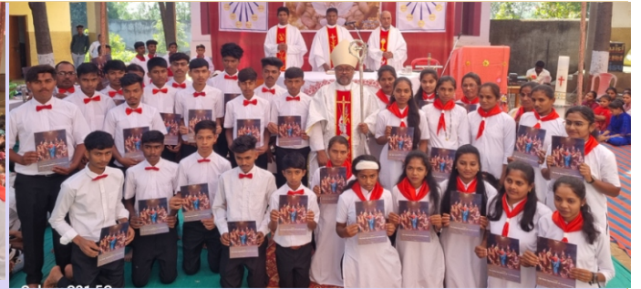
CONFIRMATIONS IN SAGBARA PARISH