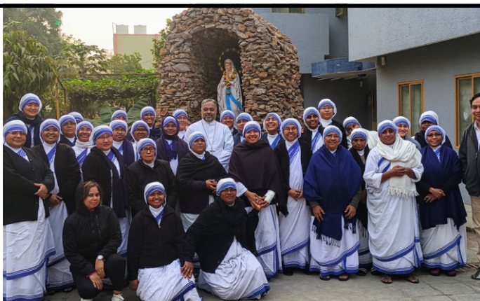
THE REGIONAL HOUSE OF THE MC OF THE MC SISTERS IN BARODA HAS A SERIES OF ONGOING FORMATION PROGRAMS FOR THE REGION.