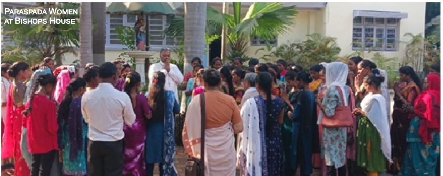
PARASPADA WOMEN AT BISHOPS HOUSE