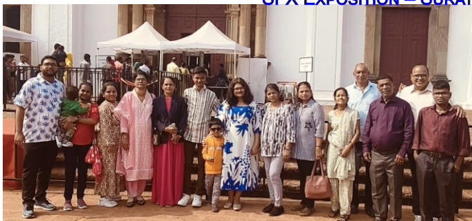
SFX EXPOSITION – SURAT