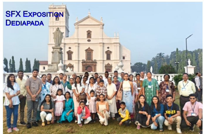
SFX EXPOSITION DEDIAPADA