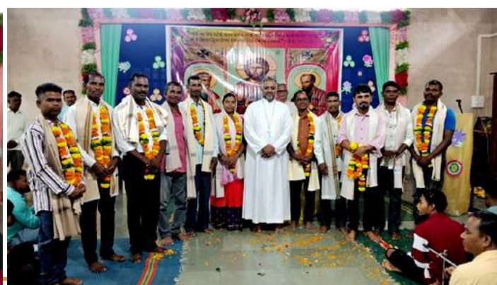
Agewans of Fulwadi and Paraspada